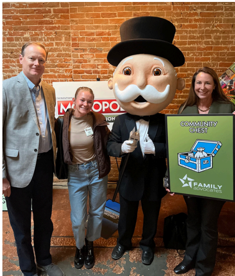
MONOPOLY BOISE EDITION