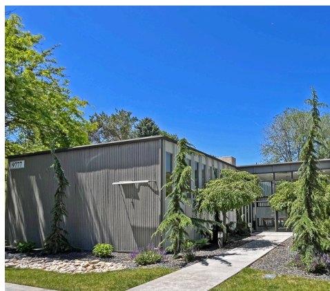
PURCHASE OF NEW BUILDING