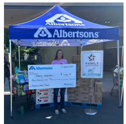
COMMUNITY BABY SHOWER