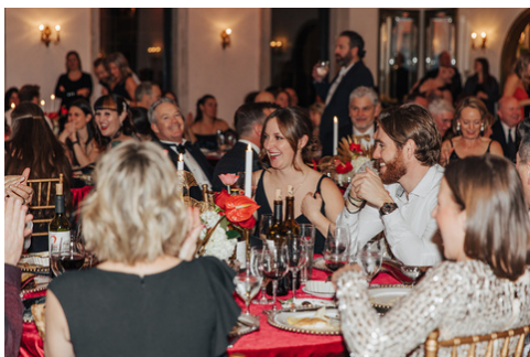
FOR THE LOVE OF A CHILD GALA