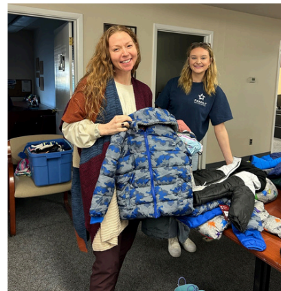
COLD WEATHER GEAR DISTRIBUTION