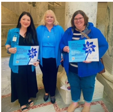
CHILD ABUSE PREVENTION MONTH